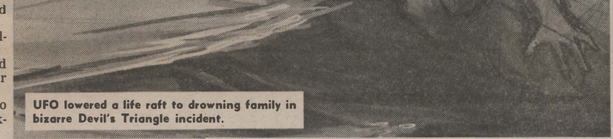
UFO lowered a life raft to drowning family in bizarre Devil's Triangle incident.

"But they did recall that the UFO crackled and hummed as it cleared the surface and moved